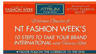
Welcome Screen in Foyer