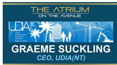
Speakers Lectern Screen