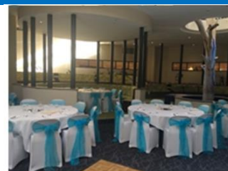
Weddings & Ceremonies