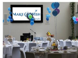
Charity Events & Shows