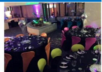
Birthdays & Anniversaries